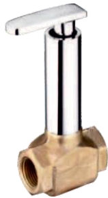
Concealed Stop Cock With Wall Flange