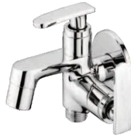
Cat Code 2005 2 Way Bib Cock With Wall Flange M.R.P. : 1120/-