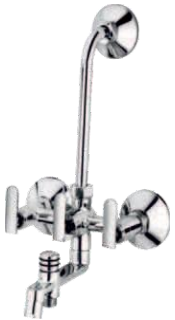
Cat Code 2013 Wall Mixer 3 in 1 System With Provon For Both Overhead and Head Shower M.R.P. : 3820/-