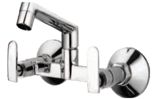
Cat Code 2009 Sink Mixer With Swinging Spout (W/M) M.R.P. : 2430/-