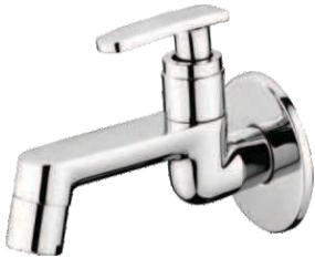
Cat Code 2004 Bib Cock Long Body With Wall Flange M.R.P. : 720/-