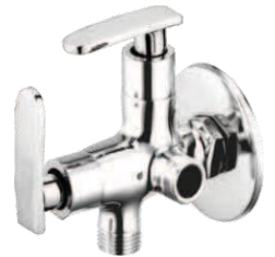
Cat Code 2016 2 In 1 Angular Stop Cock With Wall Flange M.R.P. : 1270/-