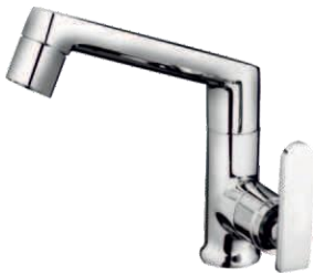
Cat Code 2007 Sink Cock With Swinging Spout (T/M-Swan Neck) M.R.P. : 1145/-