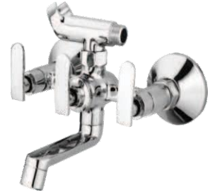
Cat Code 2012 Wall Mixer With Crutch For Provision Of head Shower M.R.P. : 3420/-