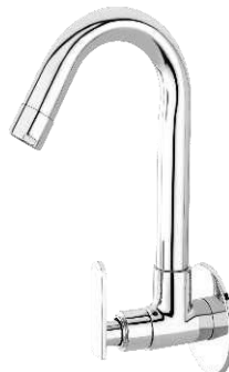
Cat Code 2019 Sink Cock With Regular Swinging Spout With Wall Flange (W-M) M.R.P. : 1100/-