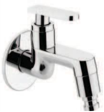
Cat Code 2017 Nozzal Bib Cock M.R.P. : 700/-