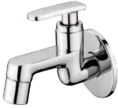
Cat Code 2001 Bib Cock With Wall Flange M.R.P. : 610/-