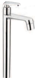
Cat Code 2018 Pillar Cock Extention Body M.R.P. : 1860/-