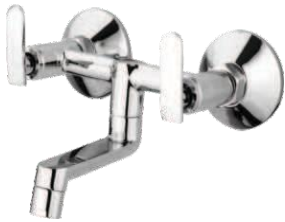
Cat Code 2010 Wall Mixer Non Telphonic M.R.P. : 2480/-