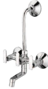
Cat Code 2011 Wall Mixer With Bend For Provision Of Overhead Shower M.R.P. : 3420/-