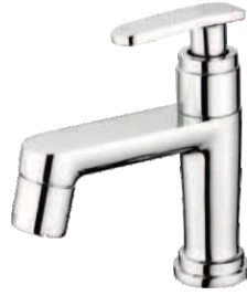
Cat Code 2002 Pillar Cock M.R.P. : 825/-