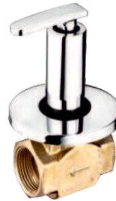
Cat Code 2015 Flush Cock With Wall Flange (Washer System) 25mm M.R.P. : 1095/-