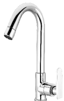
Cat Code 2020 Sink Cock With Regular Swinging Spout (T-M) M.R.P. : 1110/-