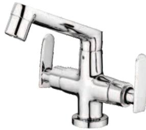
Cat Code 2008 Center Hole Basin Mixer With Swinging Spout (T/M) M.R.P. : 2155/-